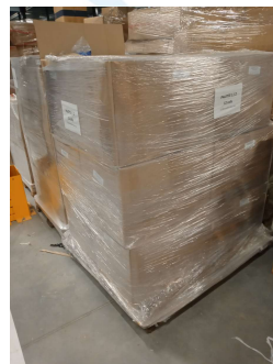
missing security band