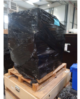
The film does not reach the base of the